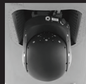
ABOVE: THE PC-12'S SURVEILLANCE POD RETRACTS, ALLOWING THE PLANE ANONYMITY ON THE RUNWAY.